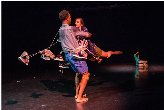
"Hiraeth."